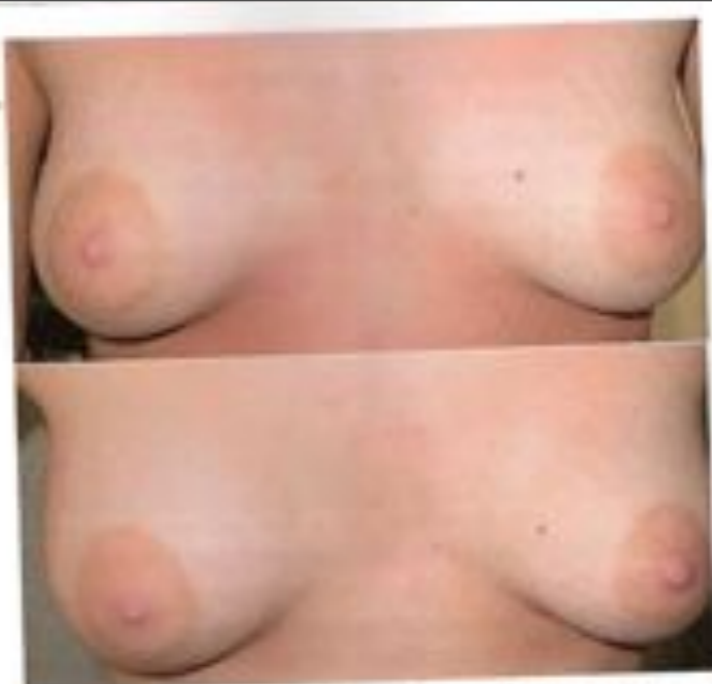
Fig. 10 Significant reduction of perianolar stretch marks at 5 months.