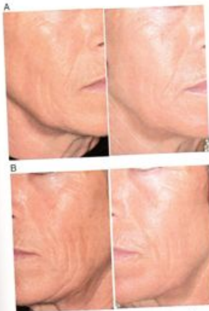
Fig. 7 A, Result at 4 months; note the skin tightening of the right cheek. B, Same patient at 4 months, left cheek.

Histology was done only on a few patients before and after needling. Von Gieson stains showed that 4 months after needling, there is a considerable increase in collagen deposition, and the collagen appears not to be laid down in parallel bundles but is in the normal lattice pattern. Increased amount of elastin has also been demonstrated.