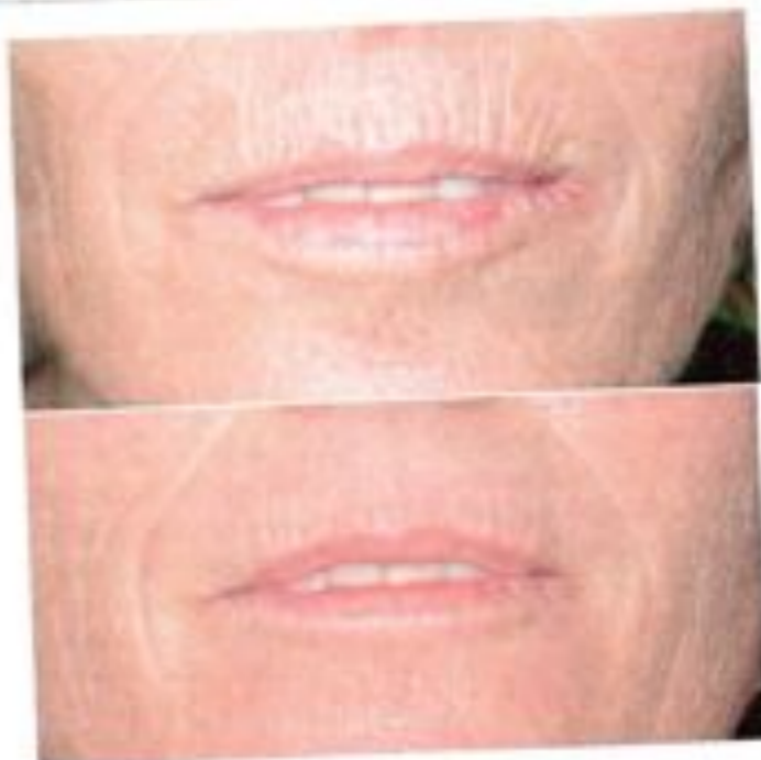
Fig. 8 Perioral rhytids treated with 2 needling procedures 6 months apart. Result after 1 year. Some lines have gone; others are still there but much more shallow.

The stratum corneum is normal, and the epidermis shows no signs of any abnormality and is of normal thickness with good rete peg formation. One could interpret the slides as showing that the rete pegs are better postoperatively than before operation.