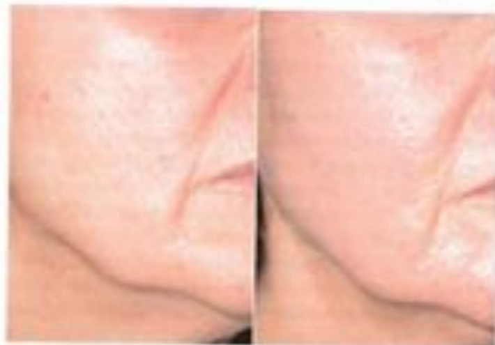
Fig. 6 Improvement of fine wrinkles of the cheek at 2 months.

rather than TGF- \beta 1 and - \beta 2, which are associated with scar collagen deposition. Transforming growth factor- \beta 3 is implicated in scarless healing and normal lattice weave collagen deposition. Percutaneous collagen induction seems to induce normal lattice weave collagen rather than scar collagen, 1 so theoretically, TGF- \beta 3 may play an important part in this very early phase.