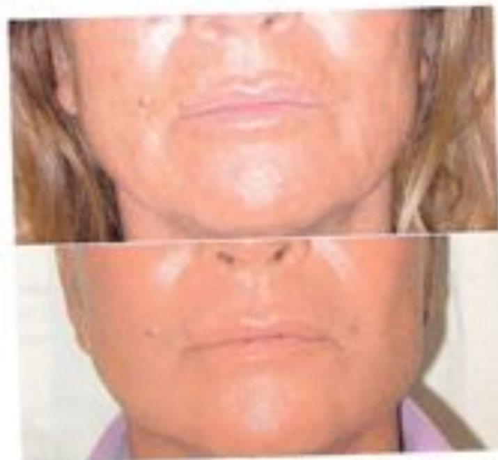
Fig. 9 A good combination: rhytidectomy (face lift) with peroral needling to improve the skin texture and the lines around the mouth. Result at 6 months.