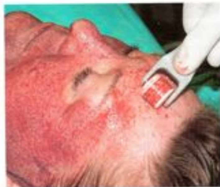
Fig. 2 The Roll-Cit 3-mm device for deep facial needling.

There are 3 phases in the body's wound healing process, which follow each other in a predictable fashion.